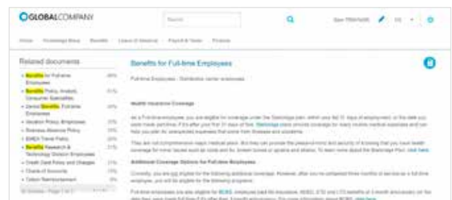
Neocase Knowledge Base Portal