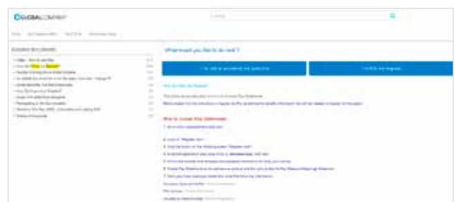
Knowledge Base Recommendation Engine - Tier 0 resolution